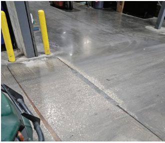
Unprotected floor shows difficulty to maintain clean surface and prevent wear