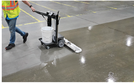
Coating process covers 20,000 sq. ft. per hour/per coat